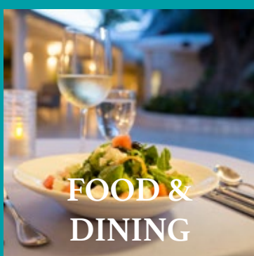
FOOD & DINING