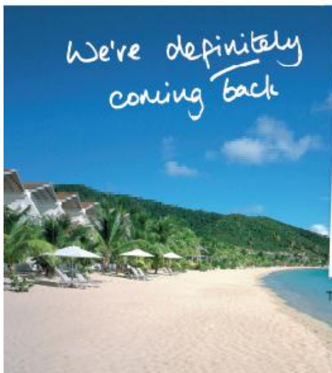
The beautiful Carlisle Bay beach and, above, a Beach Suite