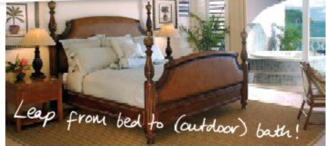
Leap from bed to (outdoor) bath!

One of the many highlights of our stay was a trip to Antigua's famed cliff-top lookout Shirley Heights to view the sunsets. Good times in a down-to-earth, people-focused resort with a stunning spa and pool... you may well see us on the repeat guest list next year!