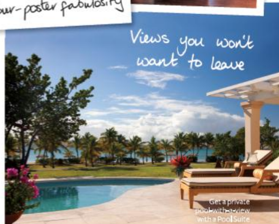
Views you won't want to leave