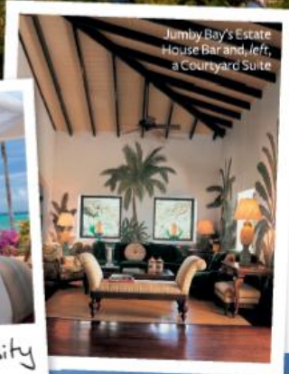
Jumby Bay's Estate House Bar and, left, a Courtyard Suite