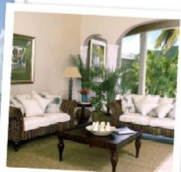
Lounge in luxury